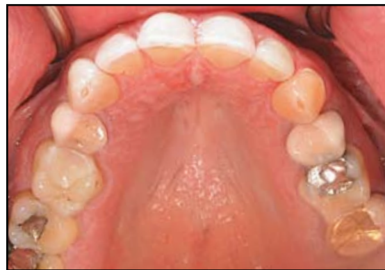
Figure 2. Preoperative view of the patient, who had his premolars removed years prior during adolescent orthodontics.