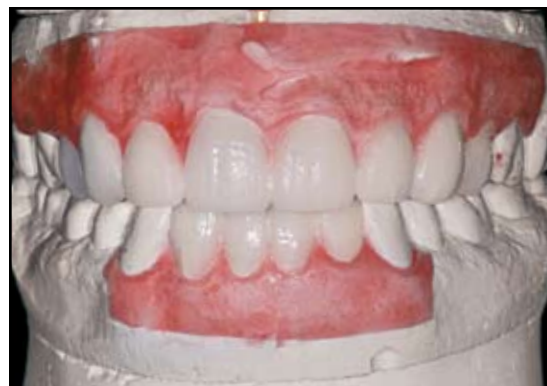
Figure 4. A diagnostic waxup was created from mounted casts and would enable the fabrication of a putty matrix for chairside tooth reduction.

Computer-assisted design / computer-aided manufacturing (CAD/CAM) applies mechanical- and laser-based scanning technology in the development of accurate, well-fitting dental restorations, and it has become a well-accepted tool in the field. Digital dental technologies such as CAD/CAM, once used for the scanning and milling of durable restorative materials (eg, restorations, abutments, frameworks), 5,7 now support the impression process as well. Based on a laser scanning protocol known as "parallel confocal" imaging, the iTero digital impression system (Cadent, Carlstadt, NJ) eliminates the need for conventional impression materials (eg, trays, putties, wash materials). The system's laser scanners capture a three-dimensional image of a prepared tooth and the opposing dentition which, when combined with a digital bite registration, are used to produce a three-dimensional image. 8 As the clinician has a magnified view of the final impression displayed chairside, any issues regarding moisture or isolation are readily apparent and can be immediately corrected. 9 When proper tissue management is used to enable visualization of