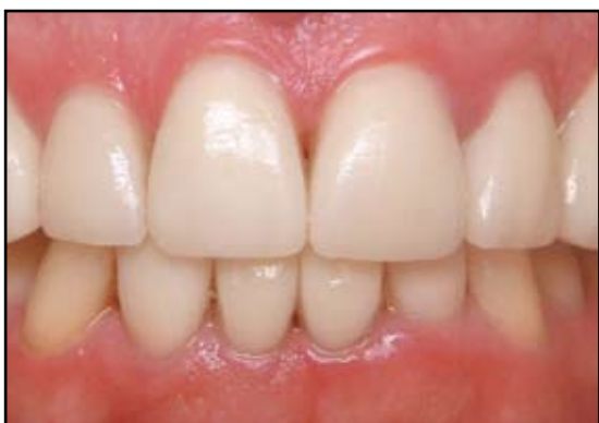
Figure 12. Immediate postoperative facial view of the bonded restorations, demonstrating enhanced aesthetics and symmetry.

On the seating appointment, the patient was anesthetized and the provisional restorations were removed. The preparations were cleaned via intraoral sandblasting and chlorhexidine. The definitive restorations were tried in to evaluate fit, contact area, occlusion, and aesthetics. The case was tried in with water-soluble gel (eg, RelyX, 3M ESPE, St. Paul, MN), and it was decided that a clear paste would be acceptable. The try-in gel was removed and the veneers were prepared with a phosphoric acid etch, rinsed, cleaned, and coated with a silane material. Following tissue retraction and hemostasis, the veneers and crowns were adhesively bonded (ie, Optibond Solo, Kerr Corporation, Orange, CA; RelyX, 3M ESPE, St. Paul, MN) in place. Excess cement was removed with use of curved scalpel and discs, and the