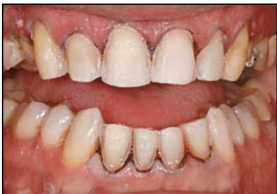
Figure 8. Facial view of the prepared dentition following the insertion of the gingival retraction cord.