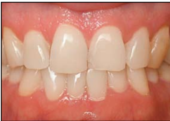
Figure 1. Preoperative facial view demonstrating a lack of occlusal harmony and aesthetics.

From a cost basis, the practice of using full-arch impressions may reach up to 30 dollars to 40 dollars for a stock tray, and 15 dollars to 20 dollars for a custom tray. Such a cost is for a single impression alone and does not factor in the remakes that clinicians may have to perform if the first impression is inadequate. Clinicians may often be unaware of the true cost of making