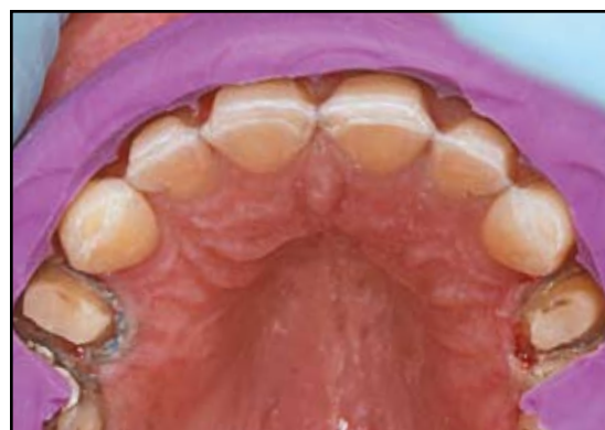
Figure 7. Clinical application of the tooth reduction guide to ensure sufficient space would exist for the zirconia full-coverage crown restorations.

Following the administration of anesthetic, the relevant case information (ie, patient name, laboratory, number of teeth, type of restoration, material, stump, and shade) was entered into the computer terminal for the