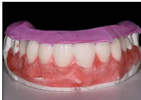
Figure 6. A reduction matrix was created from the diagnostic waxup and would be used chairside to guide tooth preparation.

removed an existing edge-to-edge bite (Figure 1). All four first premolars had been extracted prior to conventional orthodontia when the patient was in his early teens (Figure 2).