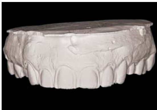
Figure 5. Prepared model in the dental laboratory indicating the amount of tooth reduction that would be necessary for the pending maxillary restorations.