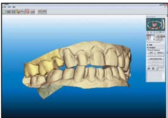
Figure 9. View of the digital impression chairside enabled immediate verification of the preparation design.

preparations, a second cord was placed and allowed to set for five minutes. A single retraction cord was placed at the veneer preparations, again allowing the clinician to refine and visualize the margins. Since the patient presented with a relatively high lip line, the author elected to keep the margins slightly subgingival. Following an additional five-minute set period, the scanning procedure was initiated.