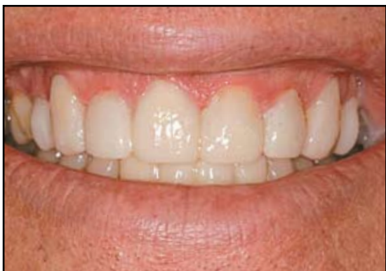
Figure 11. The provisionalization phase enabled the patient to evaluate aesthetics, function, and phonetics while the definitive restorations were fabricated.