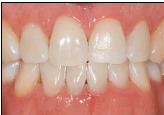
Figure 3. View of the patient's dentition following the completion of orthodontic therapy (ie, Invisalign, Align Technology, Santa Clara, CA) to relieve crowding of the mandibular incisors.

impressions for laboratory-fabricated restorations and the time and money necessary to seat a clinically acceptable, aesthetic restoration.