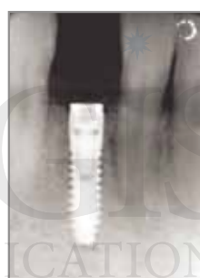
Radiograph shows proper implant spacing in limited site.