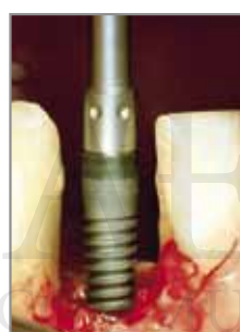
Laser-Lok 3.0 placed in esthetic zone.