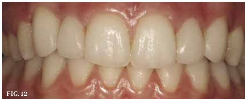
CASE PROGRESSION (4.) Before Invisalign (maxillary arch). (5.) ClinCheck screenshot (front). (6.) ClinCheck screenshot (right buckle overjet). (7.) ClinCheck screenshot (maxillary occlusal shot). (8.) After Invisalign (maxillary arch). (9.) After Invisalign (retracted smile). (10.) After veneers (full face). (11.) After veneers (retracted smile). (12.) After veneers (maxillary arch).