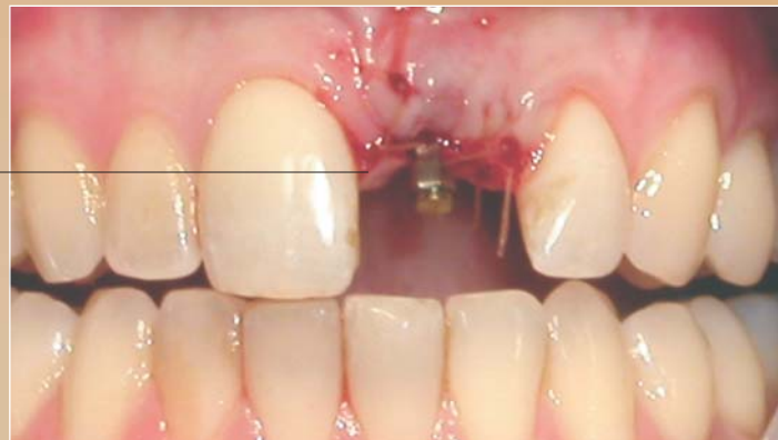
Implant uncovering at six months and connection of temporary abutment