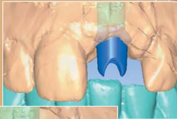
Zirconium abutment placed after three weeks of healing and preparation of adjacent central incisor