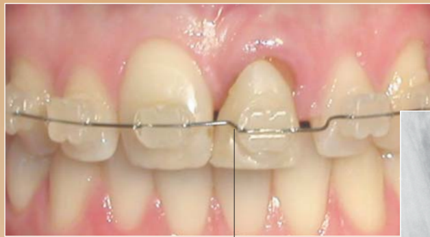
Provisional restoration on tooth #9 and orthodontic extrusion